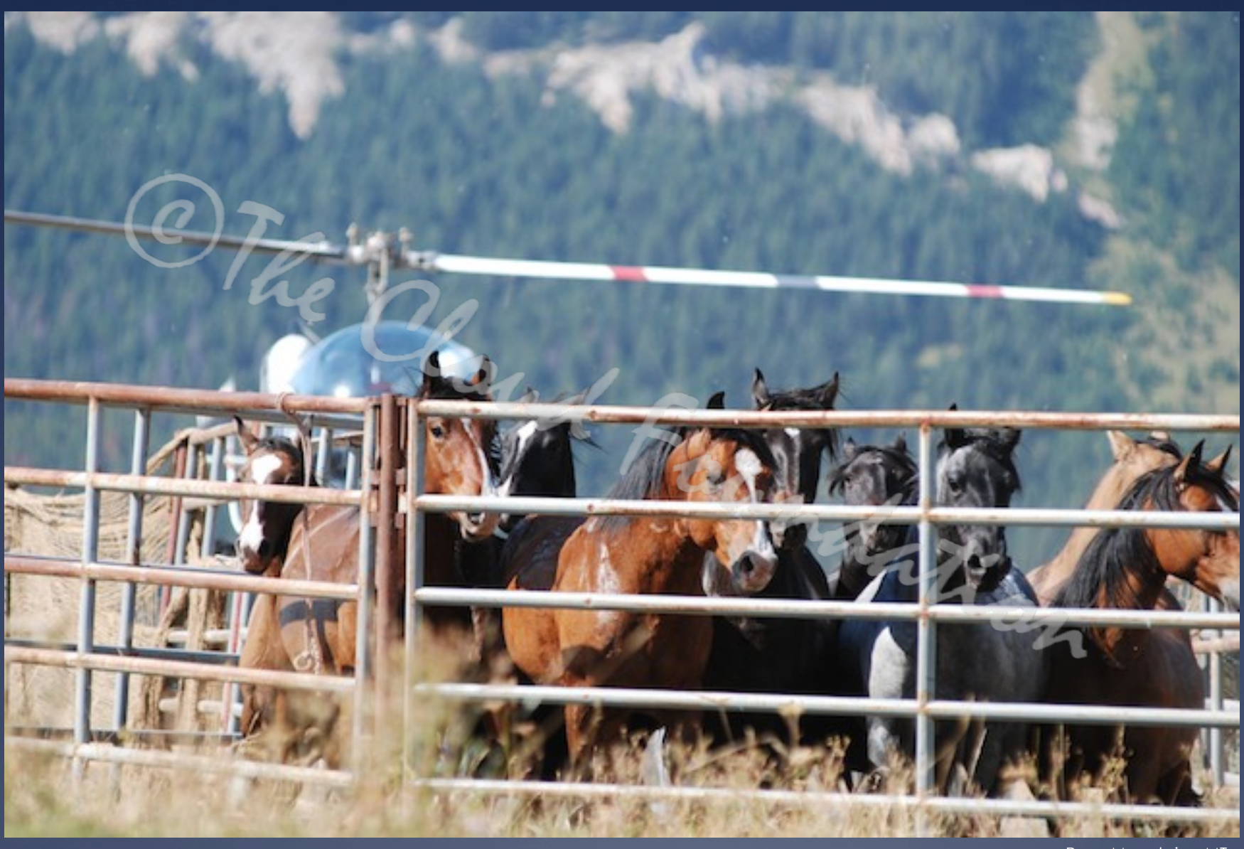
Pryor Mountains, MT 2009