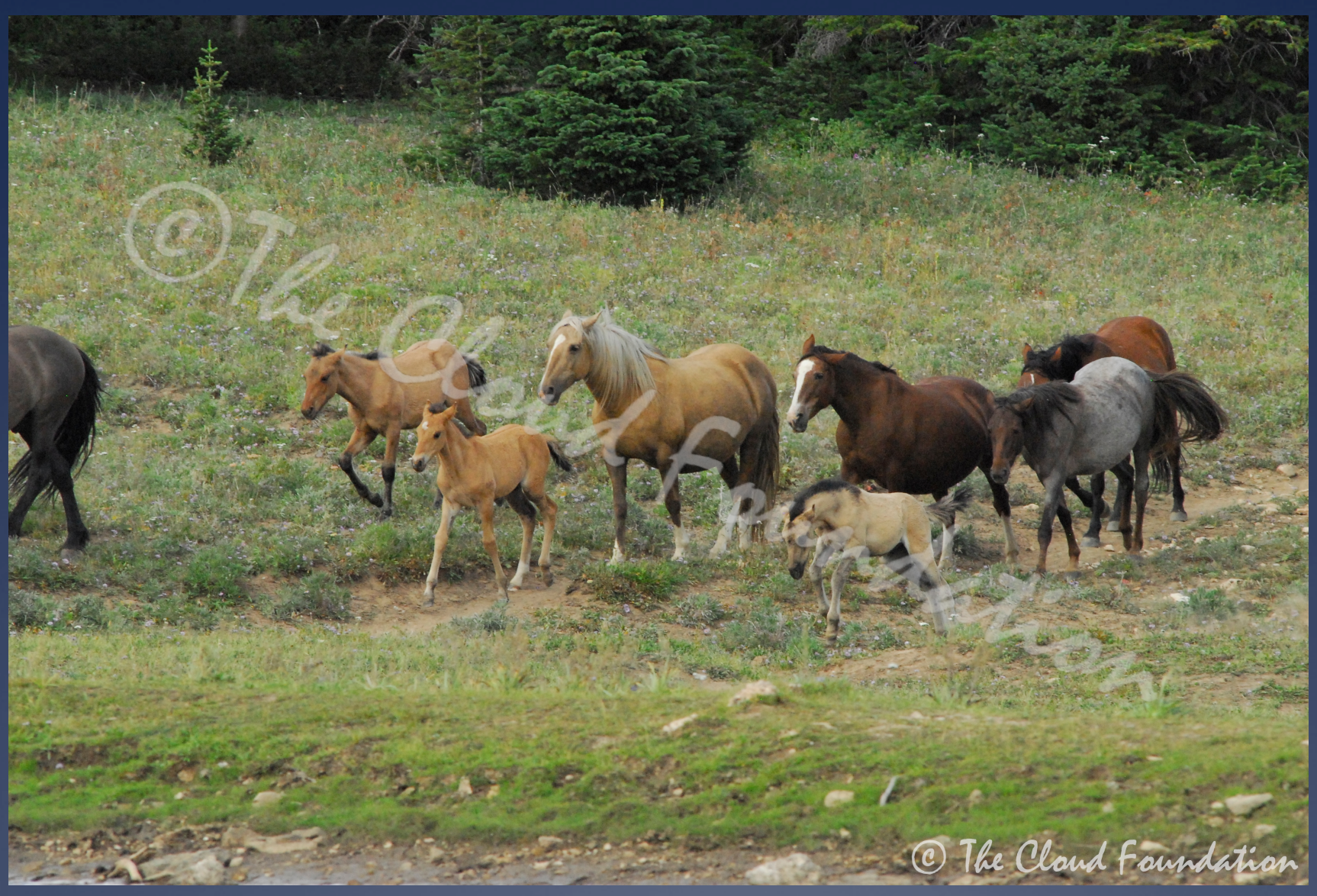
Pryor Mountains, MT