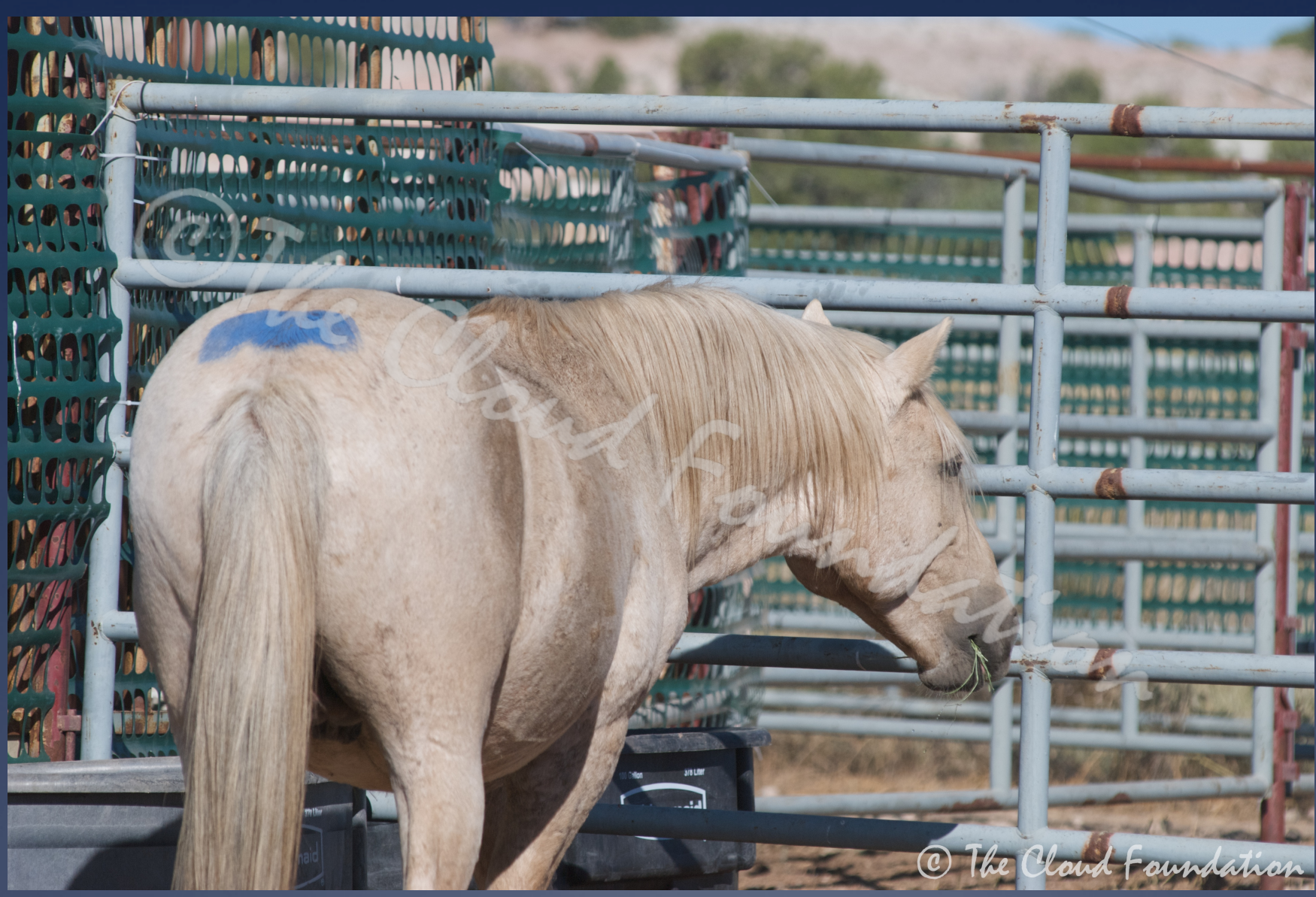
Pryor Mountains, MT 2009