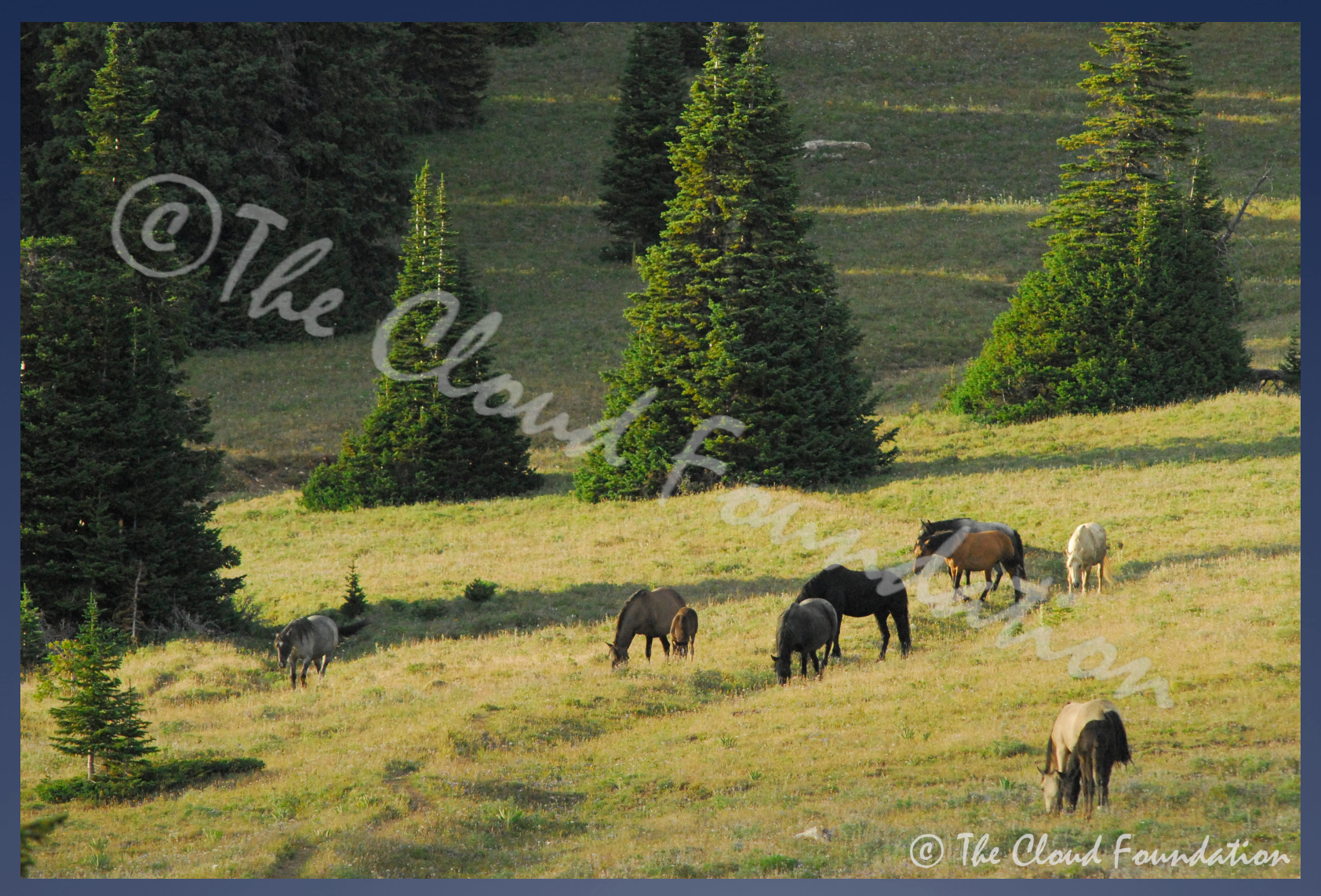
Pryor Mountains, MT