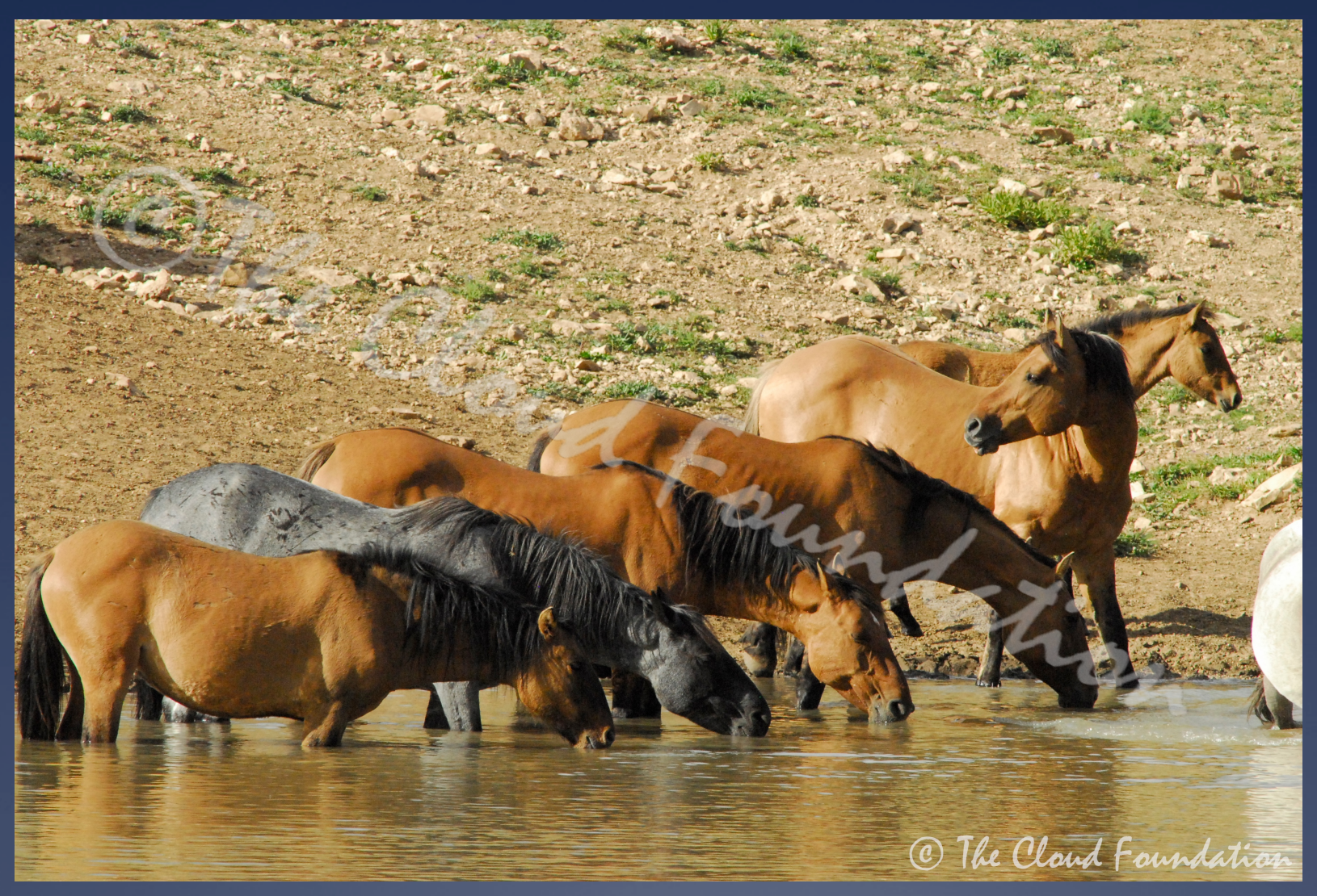
Pryor Mountains, MT