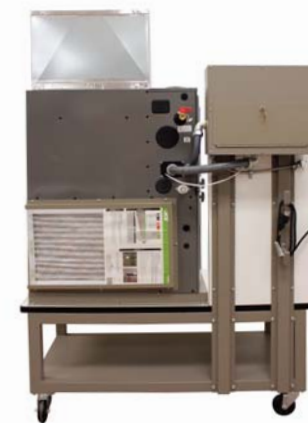
rear view ▲