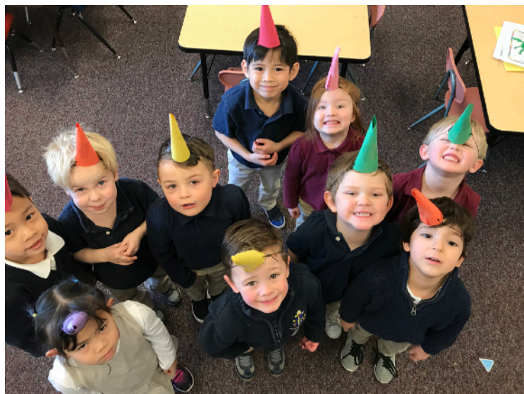
K4 learned that U is for "Unicorn."