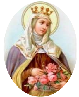
Feast Day: November 17

Sources: franciscanmedia.org and catholic.org