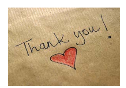
Thank You Lord

Just this once, Lord, I want to come to you without problems simply to say, Thank you: