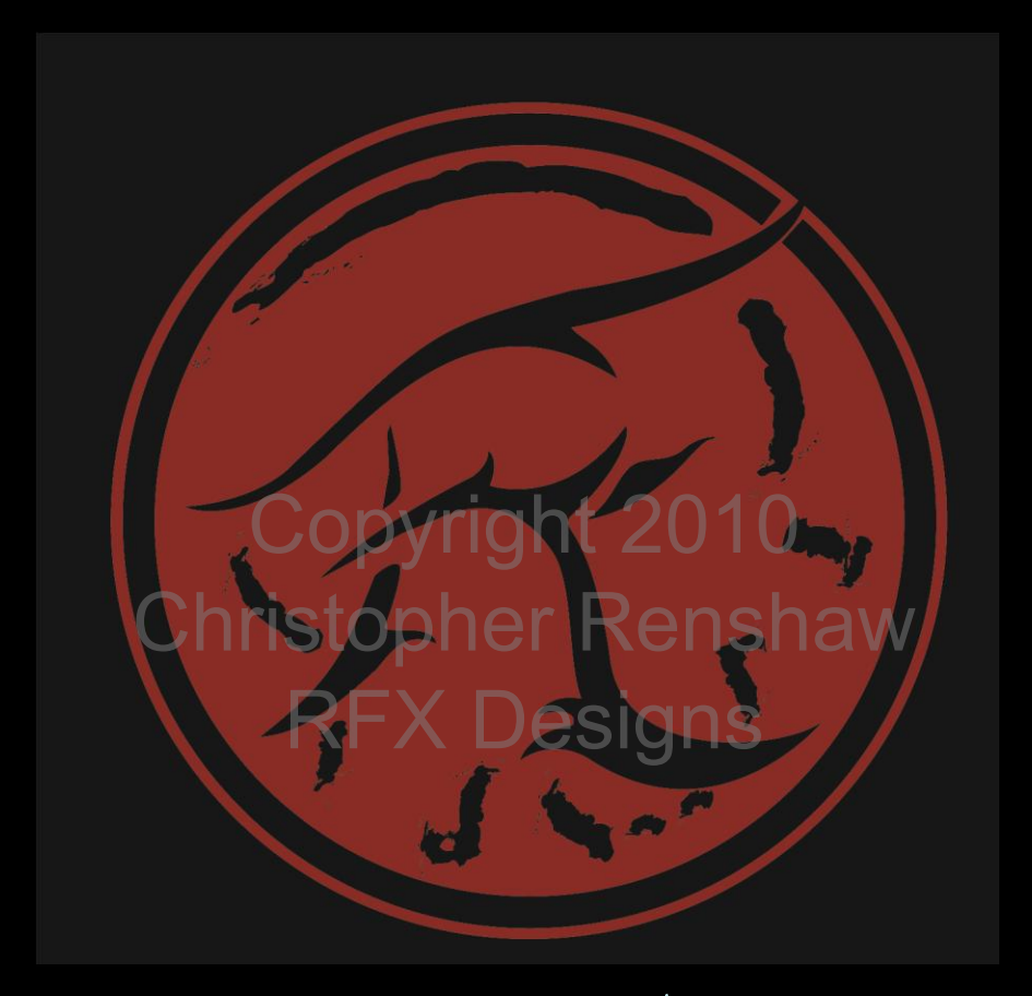
Brought to you by Raeven Fairchilde Concepts & Designs Copyright 2006