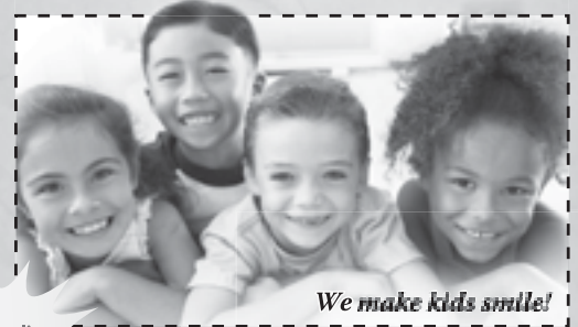
We make kids smile!

February Is National Children's Dental Health Month Your child's smile can be the key to a great future!