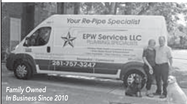
Family Owned In Business Since 2010