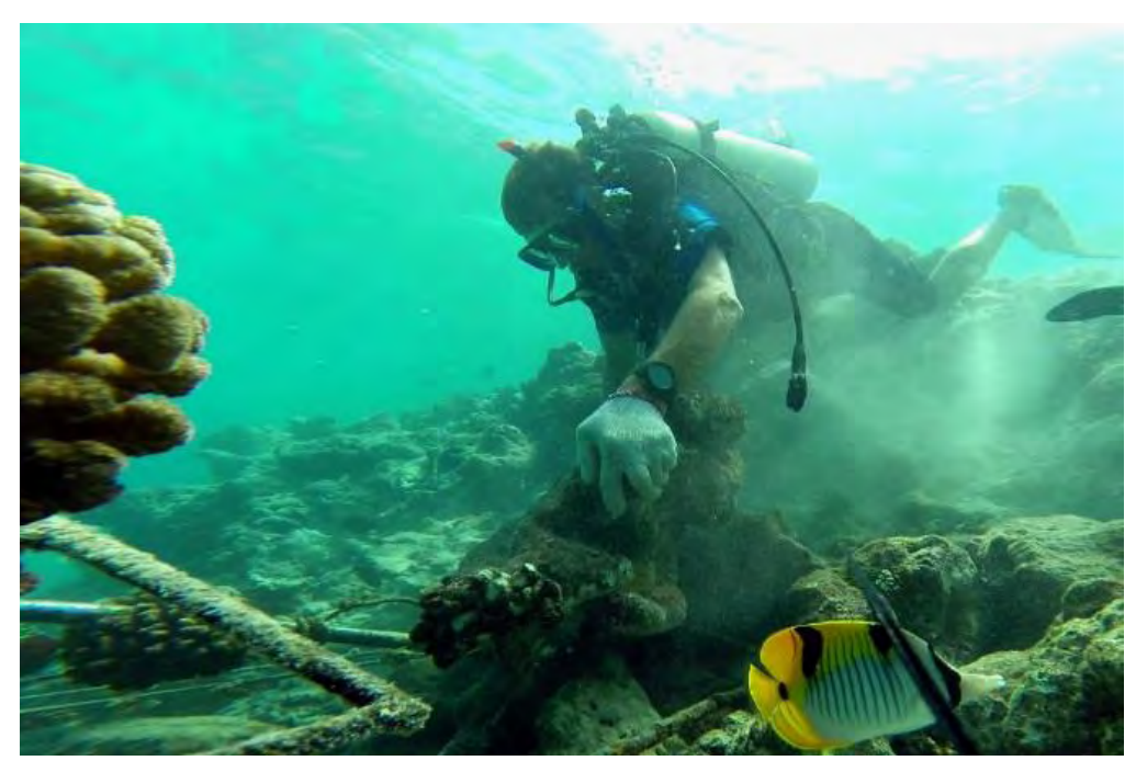
Fig. 10. The reef slope adjacent to the top of the grid was devoid of life and there was large gap а between the grid and the reef substrate (top). This was filled in with large coral boulders (bottom)

and deposited in the large gap between the grid and the reef slope. The area was completely filled in, resulting in a natural reef slope that was continuous from the grid to the shallow reef The rubble terrace. further stabilized the grid, and it resulted in a "cave" underneath the grid that provided refuge for the large resident grouper.