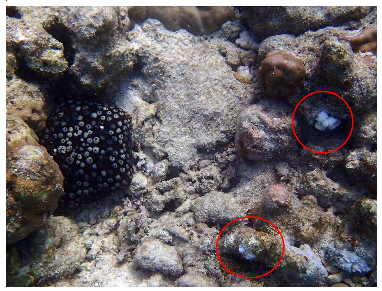
Fig. 12. A cushion starfish ( Culcita ) that had hidden under a coral at the base of the grid. The two small white coral skeletons (in red circles) were eaten by this starfish the previous evening. The reef was carefully searched for coral predators to prevent additional loss.

used as a source of fragments for the coral nursery. Completely dead corals that had died since February 2017 due to cushion starfish predation, damselfish algal lawns or other causes were removed. The resulting gaps in the created reef were filled in with new corals and other organisms. Additional corals were also placed at the perimeter of the windows to fill additional spaces where the cement platform and/or the stabilizing plates and bolts were visible.