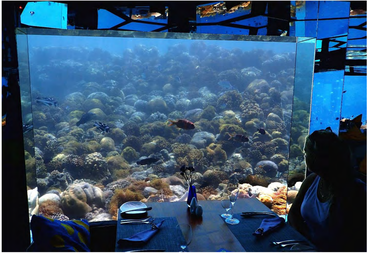
Fig. 1. The view out of the window on the right side. The grid is completely covered with coral and a living reef now extends up the reef slope behind the grid.

Coral Reef CPR scientists completed Phase II of the SEA Restaurant restoration between July and Aug 23, 2017. The restoration involved six aspects: 1) Creation of rubble reef framework behind and above grid at SEA and stabilization of metal grid; 2) sourcing of corals, sponges, anemones, soft corals and other invertebrates and relocation to SEA: 3) maintenance of shelf area through removal of predatory snails and starfish, removal of any dead corals, replacement of dead corals and filling of empty spaces with new corals; 4) construction of reef on slope adjacent to metal grid; 5) removal of coral-eating cushion starfish ( Culcita spp.) from the reef slope, reef terrace and shallow back reef environment surrounding the resort; and 6) maintenance of the coral nursery ropes and creation of a new coral nursery adjacent to the wine cellar.