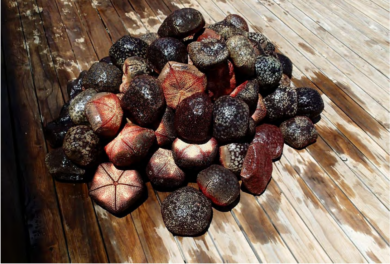
Fig. 16. The first collection of cushion stars from the reef slope next to SEA restaurant yielded 78 starfish. Another 300+ were removed from surrounding areas.

Cushion starfish ( Culcita spp.) are coral predators that feed on new recruits, juvenile colonies and larger colonies in the genus Acropora and Pocillopora . These starfish appear to aggregate among the corals transplanted to SEA Restaurant and they have been observed consuming entire Pocillopora colonies. During the initial phase of the restoration in February, 2017 a total of 87 cushion stars were removed from the reef habitat around SEA and the adjacent sections of reef. During July, 2017, larger scale searches for Culcita were undertaken on the reef slope and the shallow reef flat extending from the supply jetty to just past the arrival jetty, off Plates Restaurant. A total of 386 cushion starfish were removed.