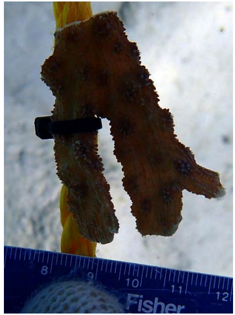
Fig. 18. A portion of two of the new ropes at the nursery at SEA (left). On one rope we attached a number of Echinopora fragments (above). This is a very rare coral that sustained high mortality in 2016. Only two colonies are known to occur at Kihavah.