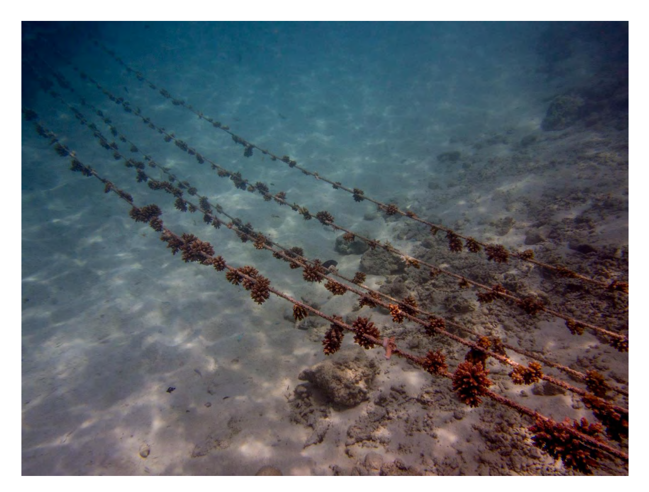
Fig. 17. Original nursery created at SEA in February 2017 showing considerable growth to fragments.

In August 2017, five new ropes were placed on the right side of the restaurant, extending from the barge platform near the wine cellar window to the reef slope. The ropes were secured on two inch metal tubes inserted into the substrate. Acropora fragments collected from the reef slope at 3-8 m depth between the arrival jetty and SEA were attached to four of the ropes. Acropora recruits (and attached coral rubble pieces) collected near Plates nursery at 3-4 m depth were secured to the fifth rope to evaluate survival. A total of 255 fragments were attached to these ropes.