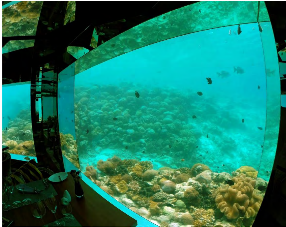
Fig. 5. View of restored habitat from the inside of SEA. The platform next to the window in the foreground was restored in February 2017 and a new reef visible in the distance was constructed in July/August 2017.

predation and disease. The restoration offers both ecological and human benefits. New, healthy habitat was created to provide refuge for other animals. It also serves to concentrate organisms that reproduce primarily through spawning, thereby increasing the likelihood of successful fertilization. A healthy reef community showcases the diversity and vibrancy of Maldivian coral reefs and offers guests the opportunity to understand and appreciate these reefs without getting wet. It also serves to increase awareness of the vulnerable state of reefs and tangible actions that can be taken to help them survive and thrive.