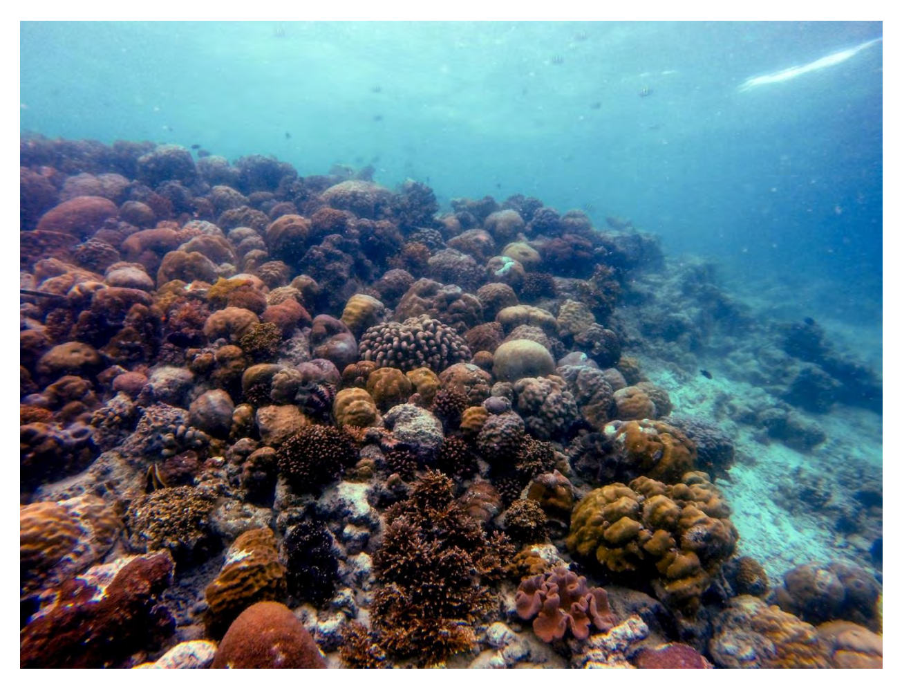
Fig. 9. The right side of the restored reef, showing the same section of reef slope after the restoration.

Fig. 8. A mosaic showing the reef slope off the right side of the restaurant, adjacent to the grid, prior to the restoration.