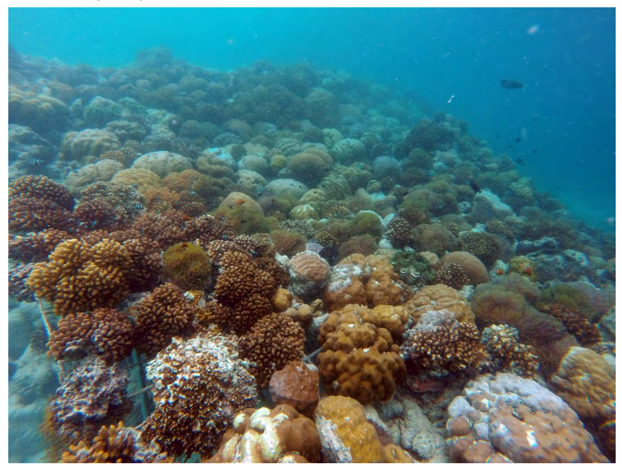
Fig. 3. The grid and restored reef. The area now has >85% living coral cover and it forms a continuous reef system that extends upward from the grid to the reef flat at 1.5 m and seaward towards the drop-off.

with a total diversity of 37 different species. A total of 340 corals and other benthic organisms (10-200 cm diameter) were used to restore a section of reef that extended 5 m from the seafloor to the shallow reef flat and 8 m in length from the edge of the grid, seaward 8 m from the drop-off. A total of 47 square meters of reef habitat was restored, with resulting living coral cover of >85%.