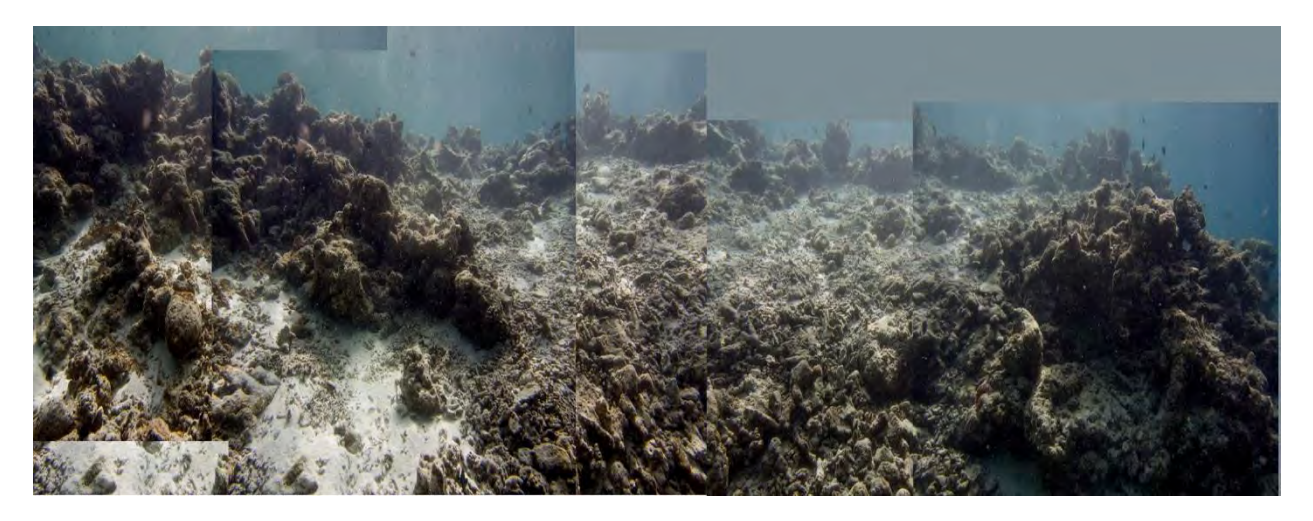
Fig. 8. A mosaic showing the reef slope off the right side of the restaurant, adjacent to the grid, prior to the restoration.