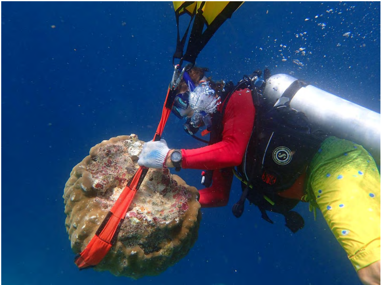
Fig. 11. Large boulders, up to 200 kg were relocated to the restoration site using lift bags.

Extensive search was undertaken in the reef habitat and adjacent sand/rubble slope and platform for organisms that were suitable for use in the restoration. Any detached/loose/broken boulder corals that were freely rolling around the substrate were transported using lift bags to the restoration site. Other detached organisms and organisms being buried by sediment were also collected and transported underwater in large plastic tubs to the site. Branching corals included specimens that were infested with coral eating snails, branches that had partly died and were covered in algae, colonies under attack by cushion stars, and detached fragments that had accumulated in no-reef environments. Organisms were collected from an extensive area, beginning adjacent to the shoreline, extending across the entire reef platform and on the reef slope to 20 m depth. The search area extended from the arrival jetty to the spa.