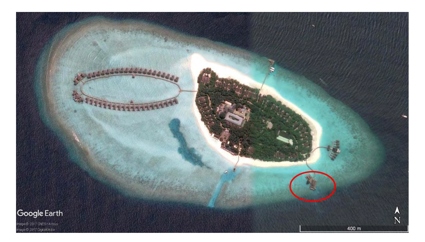
Fig. 7. Google Earth image from 2017 showing an aerial view of Anantara Kihavah Villas. SEA Restaurant is located within the red circle.

The restaurant faces south, towards the Kudarikilu Kandu channel. This narrow channel separates the northern and southern "sub-atolls" that make up Baa Atoll. This channel has depths of up to 256 m and is characterized by strong currents and tidal flow. As a result, the underwater restaurant provides a unique opportunity to view pelagic fishes such as sharks, tuna, and trevally, along with diverse fore reef community inhabitants.