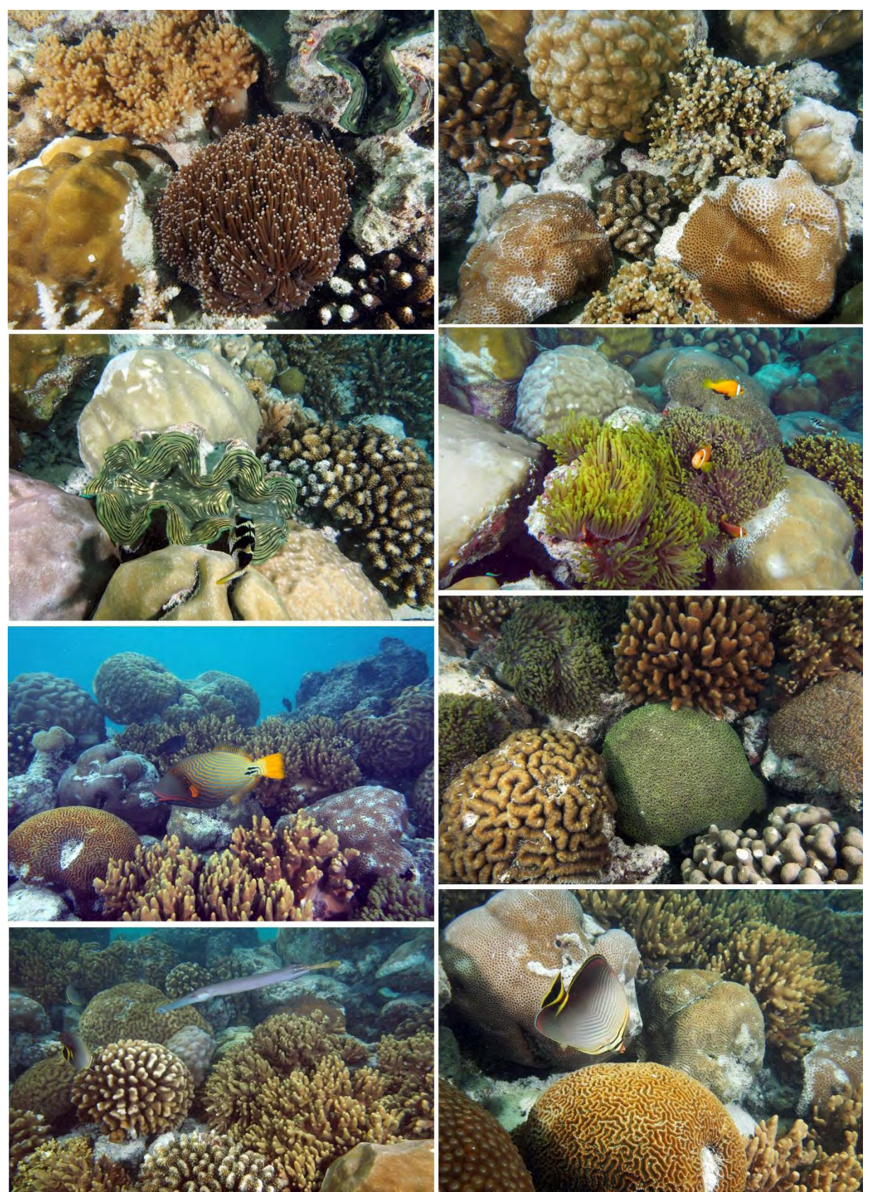
Fig. 15. Examples of the diversity of corals within the newly restored reef.