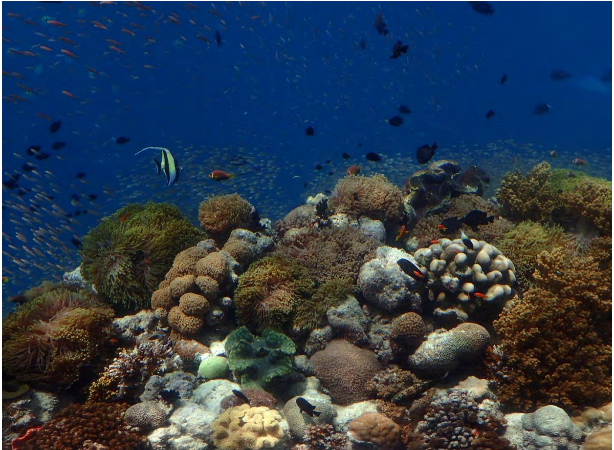
Fig. 2. The cement platform in front of the windows was restored in Feb. 2017. The corals have shown very high survivorship and this is now a thriving reef community.

eaten. The snails and cushion starfish were removed and the dead/damaged corals were replaced. In total 12 out of 680 transplanted organisms were replaced (1.8%). Additional corals were also placed onto the metal grid off the left side to completely cover this structure.