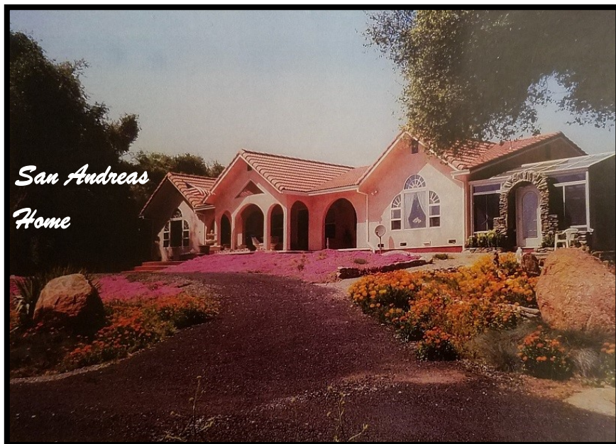
San Andreas Home