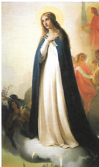
THE ASSUMPTION OF THE VIRGIN MARY, PAVIA CATHEDRAL

From Catholic and Cornered: Answers to Common Questions About Your Faith , © 2011 Liguori Publications