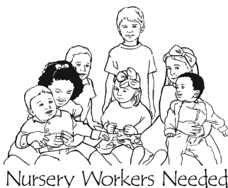
Nursery Workers Needed