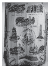
Quilt - $49.95