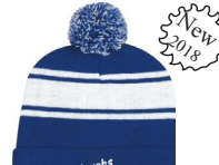
Houghs Neck Embroidered Stocking Hat ~ $10.00