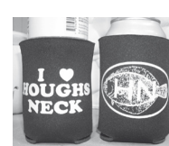
HN Can Koosie's - $3.00