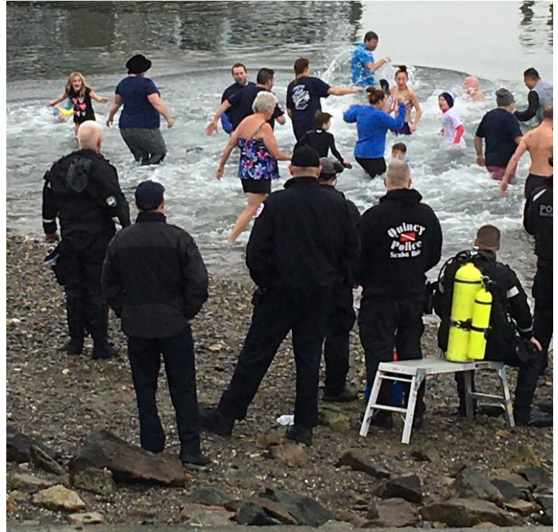
Thanks QPD Marine Unit