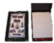
Note Caddy/Pad & Pencil $7.00 6-3/4" X 4-1/2"