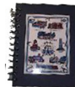
Journal - $10.00 7-1/4" X 5-1/2"