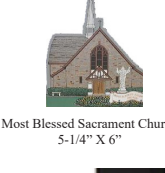
Most Blessed Sacrament Church 5-1/4" X 6"