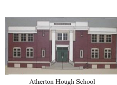
Atherton Hough School 7" X 3-1/2"