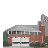
Houghs Neck Fire Station 6" X 4-1/4"