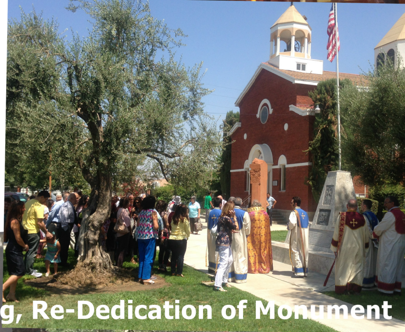
Asdvadzdzin, Grape Blessing, Re-Dedication of Monument