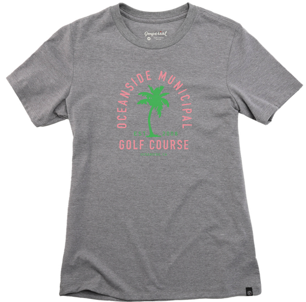
20200 The Après Ladies

Mens' long sleeve crew neck • Athletic fit • Sizes: XS - 2XL 44 singles USA long staple cotton for buttery softness 96% combed ring-spun cotton, 4% spandex 5.0 oz. • Set in 1x1 ribbed knit collar Rolled shoulders and double needle sewing at seams Pictured: forest green