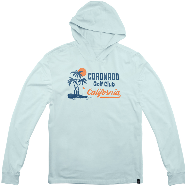
10200H The Après Hoodie

Mens' short sleeve crew neck • Athletic fit • Sizes: XS - 3XL 44 singles USA long staple cotton for buttery softness 96% combed ring-spun cotton, 4% spandex 5.0 oz. • Set in 1x1 ribbed knit collar Rolled shoulders and double needle sewing at seams Pictured: midnight navy