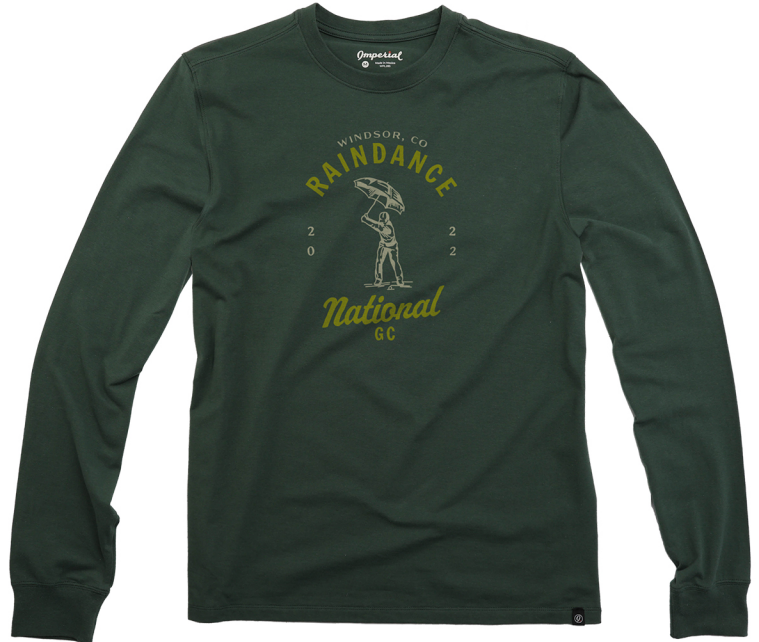
10200L The Après Long Sleeve

Mens' short sleeve crew neck • Athletic fit • Sizes: S - 3XL 44 singles USA long staple cotton for buttery softness 96% combed ring-spun cotton, 4% spandex 5.0 oz. • Set in 1x1 ribbed knit collar Rolled shoulders and double needle sewing at seams Pictured: midnight navy