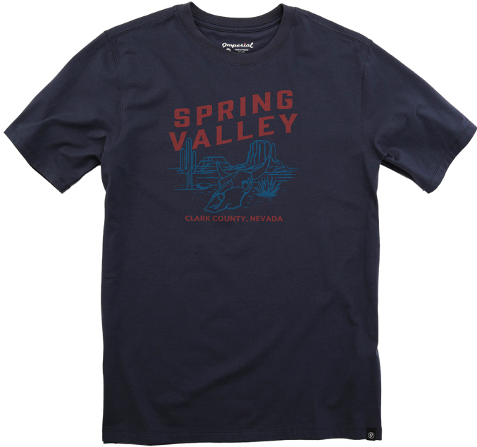
10200 The Après Tee

Mens' short sleeve crew neck • Athletic fit • Sizes: S - 3XL 44 singles USA long staple cotton for buttery softness 96% combed ring-spun cotton, 4% spandex 5.0 oz. • Set in 1x1 ribbed knit collar Rolled shoulders and double needle sewing at seams Pictured: midnight navy