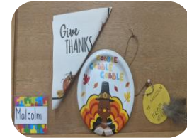
Table Setting Rising Sunrise & Peace

As one of our Sunrise traditions, the day before our Thanksgiving break the classrooms make Native American necklaces and usually prepare snack together (this year we just made the necklaces). Classroom A made the necklaces for the students in Classroom B and vice versa. These necklaces have the Native American symbol of a broken arrow for peace or a rising sun symbol depicting sunrise. We enjoyed a group snack of corn bread and raisins, and we enjoyed our Sharing Time while wearing the necklaces that the other classroom made for us!