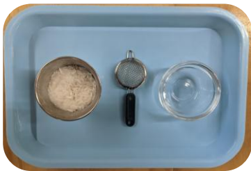
Rice & Salt Sifting

The practical life skills continue to expand. Here are few new works that were added to the shelves in November.