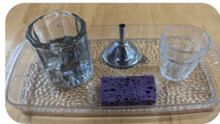
Pouring & Funnel Work