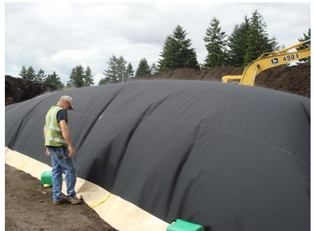
Odor & VOC Testing at Tenino, WA; June 2007