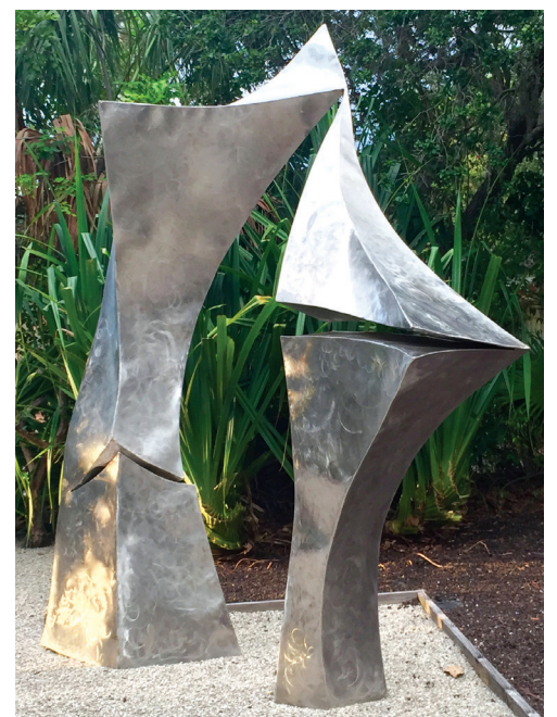
Vicky Randall, "Clockwork: Another Passage", Stainless steel, 14"x8'5"x3"