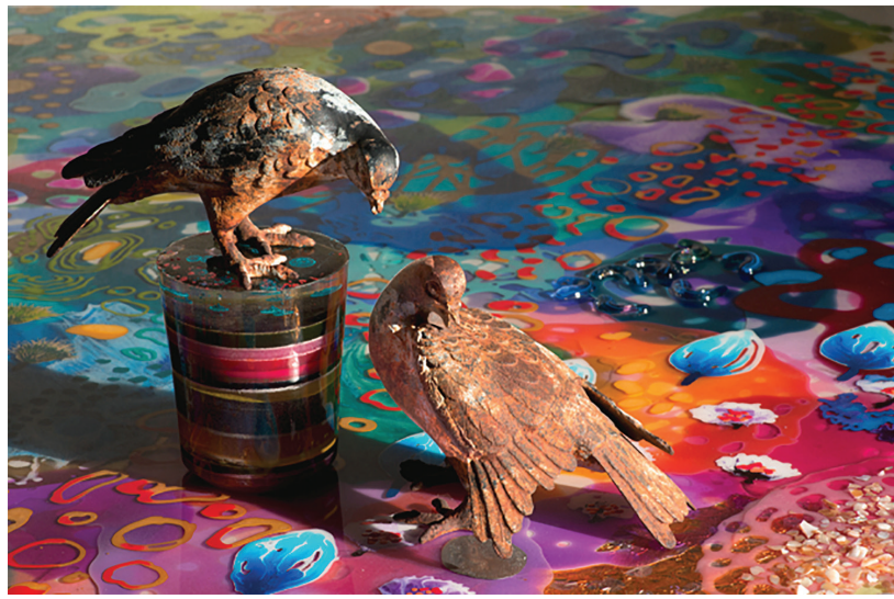
Charles Reich, "Birdvisions", Still Life Photo and color management software, 17"x28"