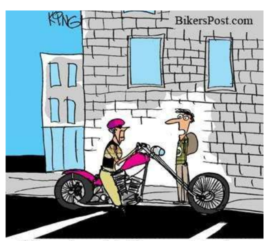
"Grandma, I told you not to show up at my school on your bike. I don't want people knowing you're cooler than me