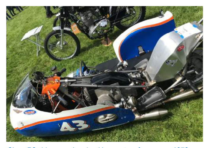
Class P2 sidecar racing rig. Has custom frame, pre-1972 engine, 336 sport cam, dual ignition, 5 speed transmission.