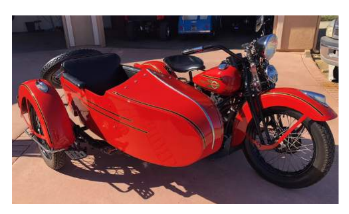
Tim Burn's 1937 Harley-Davidson Model U.