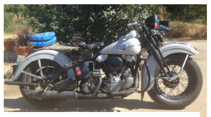
Tim Burn's 1946 Harley-Davidson EL Knucklehead.