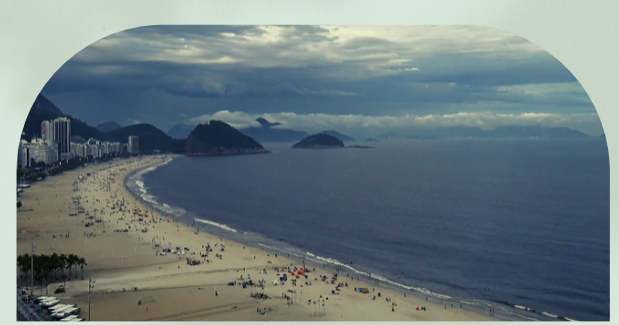
COPACABANA IN RIO DE JANEIRO, BRAZIL

CLICK ON THE IMAGE TO BE DIRECTED TO A WEBSITE TO GET A TOUR OF THE ABOVE NATIONAL PARKS BY A PARK RANGER. GOOGLE PARTNERED WITH THE NATIONAL PARKS ASSOCIATION TO USE HD VIDEO AND NARRATION TO BRING THE EXPERIENCE OF THE NATIONAL PARKS TO YOUR OWN HOME.