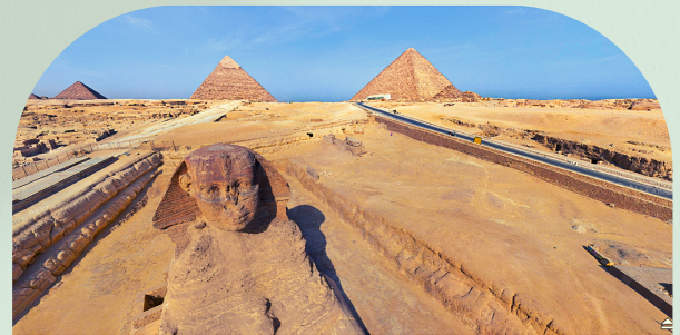
THE GREAT PYRAMIDS OF GIZA

CLICK ON THE IMAGE TO VIEW A LIVE WEBCAM OF THE BEACH IN BRAZIL! THE WEBSITE HAS OTHER LIVE CAMERAS FROM AROUND THE WORLD.