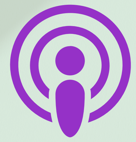
OPRAH'S LIST OF THE BEST MOTIVATIONAL PODCASTS