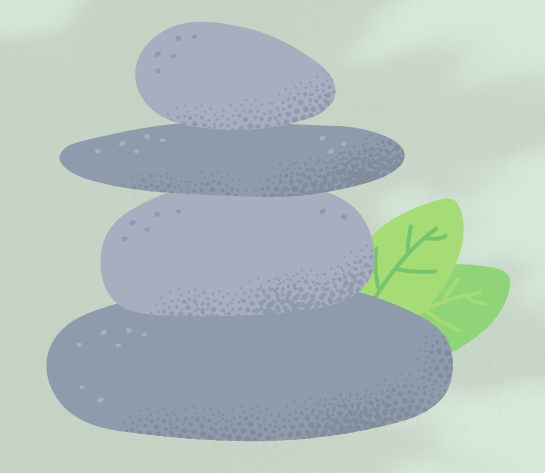
BREATH MEDITATION THROUGH UCLA