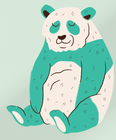
VIRTUAL CALMING ROOM: VISUAL RELAXATION