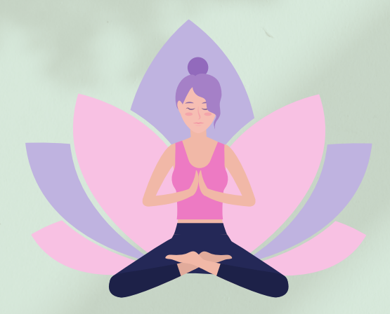
ACCESSIBLE CHAIR YOGA (APPROX. 20 MINUTES)