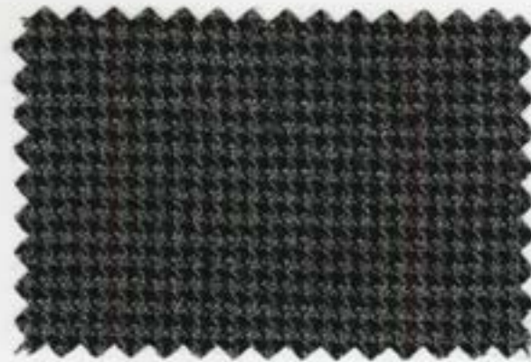
1563A Grey Overplaid