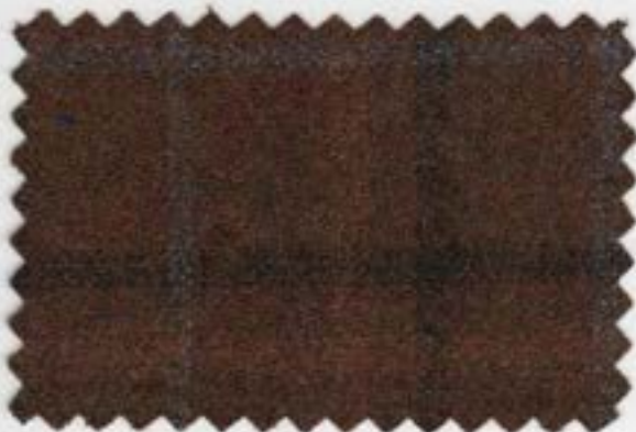
2124 Rust Plaid