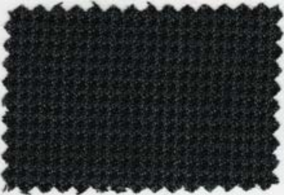
1562 Blue Check