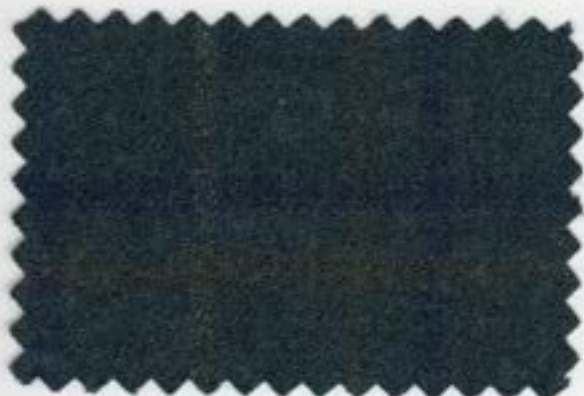
2125 Teal Plaid