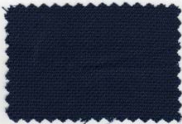
2002 New Blue

Regular 38-60 Short 38-48 Long 40-60 X-Long 44-56