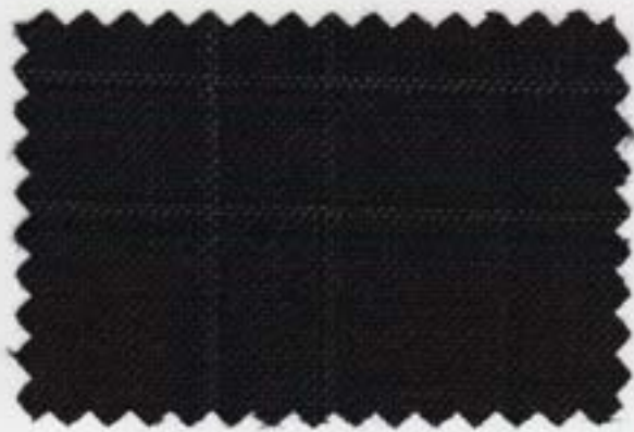
1758 Plum Plaid