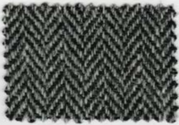
1343 Black & White Herringbone