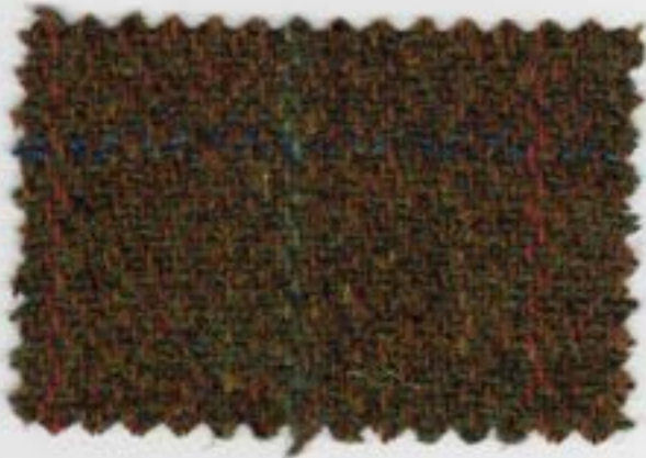
1349 Burnt Orange Overplaid