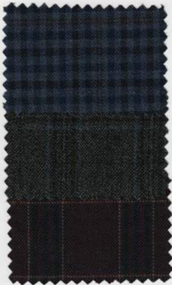
1242 Blue Check