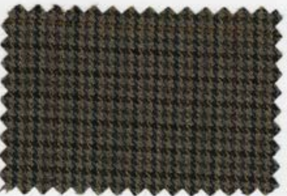
1564 Taupe Houndstooth