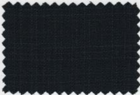
68102 Dark Navy