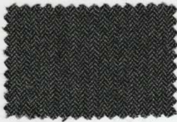
1303 Grey Herringbone