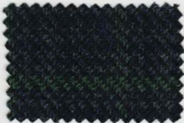
2122 Blue w/Green Overplaid

Regular 38-60 Short 38-48 Long 40-60 X-Long 44-56