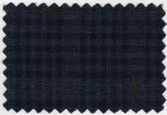
1752 Navy Plaid