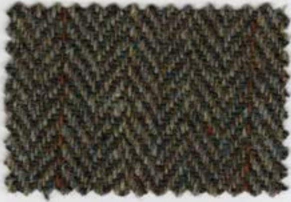
1345 Olive Windowpane