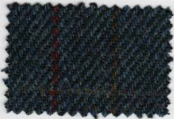
1352 Blue Overplaid