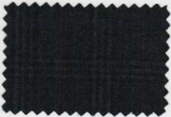
1753 Charcoal Plaid