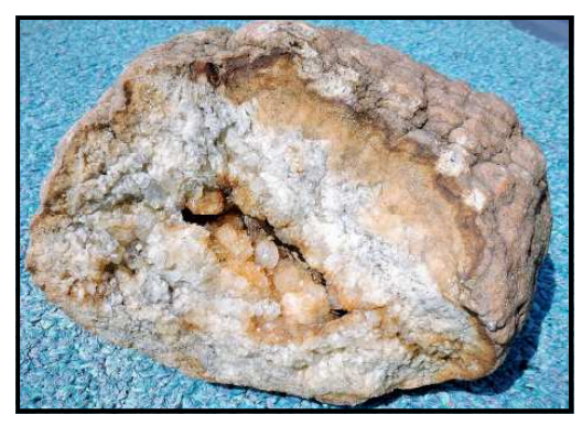
Specimens from Linda Spaulding's collection that will be auctioned at October club meeting.