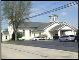
December 15, 2019

Want to stream movies through your Internet service? FORMED has movies for your viewing pleasure that can also help you grow in your Catholic Faith. There are movies for kids and families. To register go to nsoregion.formed.org and sign up.