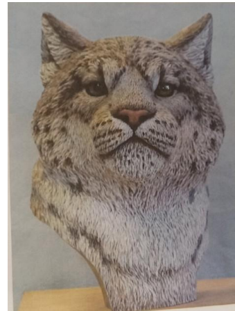
Snow Leopard $24

Painting will be done in Aug. Dates not noted yet.