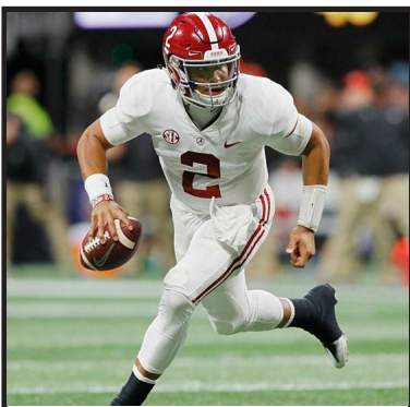
No. 1 Alabama led by QB Jalen Hurts rallied from a 28-14 second half deficit to beat No. 4 Georgia 35-28 in the SEC Championship game last Saturday. The Crimson Tide were underdogs on the money line during live wagering odds.

Just two weeks ago, it looked like this year's Heisman Trophy race would have no drama as Alabama QB Tua Tagovailoa was a massive favorite at -1000. That means you'd have to bet $10 to win $1 on Tua. However, after a sub-par performance in the SEC championship game, the odds have dramatically shifted and now Oklahoma QB Kyler Murray is the new favorite. Keep in mind, about 10% of the vote was turned in prior to last week's games. Does somebody out there know something we don't? We sure hope so as we only made a few Heisman bets this year and one of them was on Kyler Murray (see ticket above).