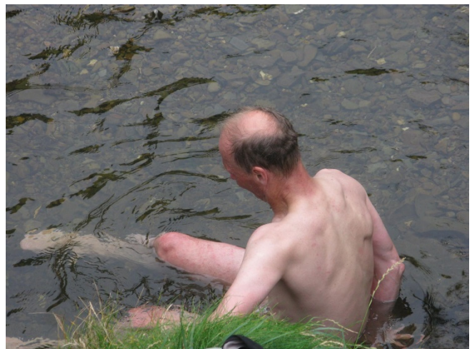
Leeky squeaky clean