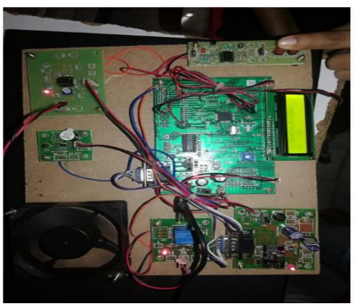
Fig.1: Working model.