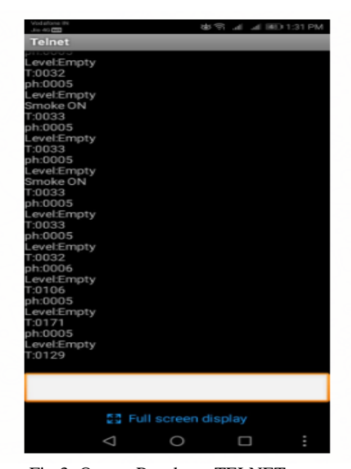
Fig.3: Output Results at TELNET app.