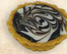
4316 2" Chocolate Ganache Tart