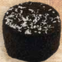
4207 Midnight Mocha