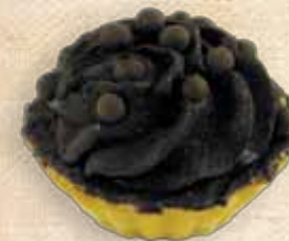
4318 Tri- Chocolate Crunch