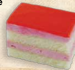
4213 Raspberry Mirror Cake