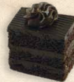
4230 Chocolate Fudge Cake