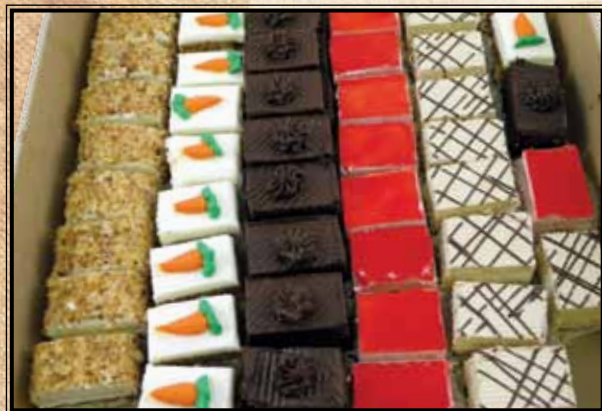
4199 Assorted Mini Cakes Box of 45