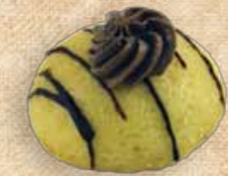
4205 Almond Sphere