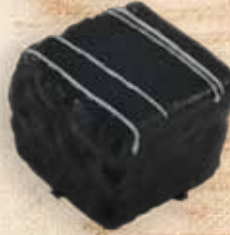
4209 Petit Four Dark