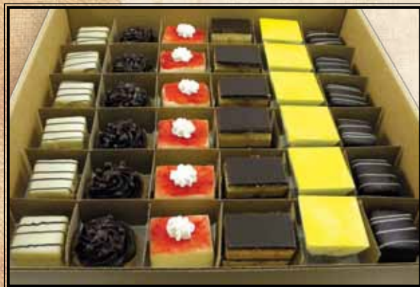
4197 Assorted Mini Gourmet Pastries Box of 36