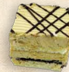
4229 Cappuccino Cake