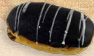
4201 Éclairs Filled with Caramel Cream