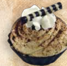
4235 Tiramisu Chocolate Cup