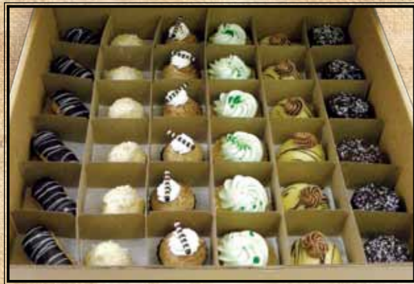
4240 Assorted Mini Pastries Box of 36