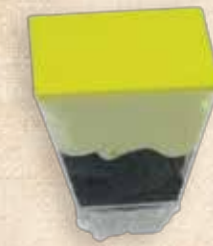
4225 Oreo Lemon Mirror Mousse Cup