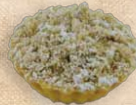
4328 Raspberry Streusel Filled with Caramel Cream