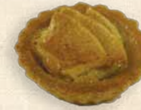
4319 2" Rustic Apple Tart