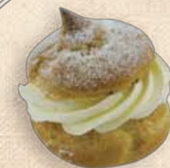
4234 Mini Cream Puff with Snow