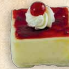
4231 White Chocolate Cheese Cake