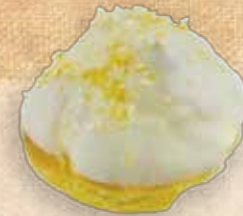
4202 Cream Puff Filled