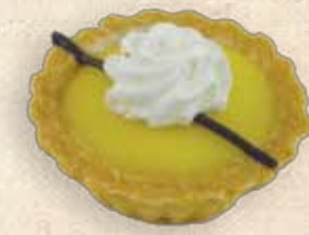
4321 2" Lemon Tart