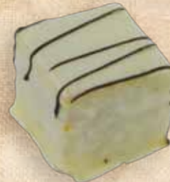
4208 Petit Four White