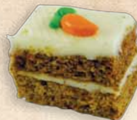
4215 Carrot Cake Slice