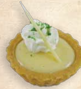
4317 2" Keylime Tart