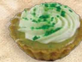
4315 2" Green Tea/ Lemon Tart