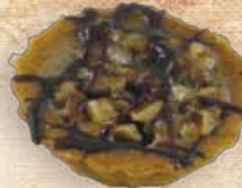
4324 2" Pecan Tart