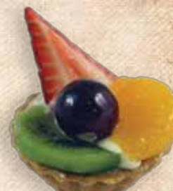
4322 2" Fruit Tart