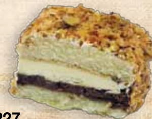
4227 Italian Rum Slice