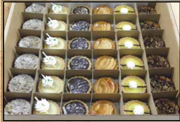
4333 Assorted 2" Tarts Box of 36