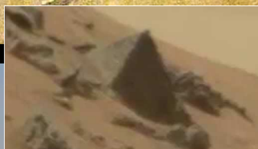
Photograph of apparent pyramid on Mars by Rover

Perhaps those that were in the proximity of Earth are the ones that forsook their estate and came down during the days of Enoch at Mt. Hermon. This also goes along the Biblical narrative that there has been war in the Heavens due to Lucifer's rebellion and perhaps the wreckage of planets as seen by the evidence of surface bombardments across the Solar System speaks of this Luciferian Angelic War that scared the planet Mars for example. Since the Flood, these same Fallen Angel entities have been waiting for Humanity to catch up to the technology so they can pick up where they left off sort of speak. It has only been in the last few decades that the technological sophistication now exist to do what was done as in the Days of Noah.