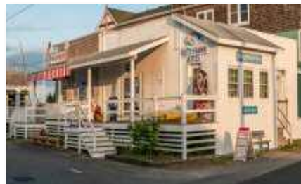
Generator Plant, ca. 1936