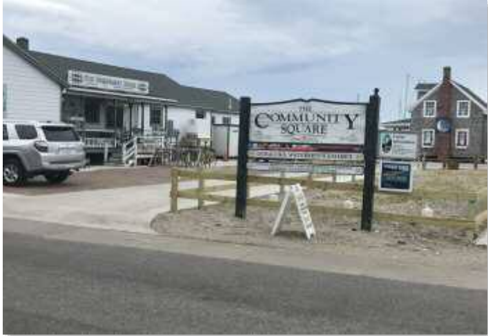
Spring 2018 - Completed! The Community Square's new parking lot, wastewater upgrades, and stormwater mitigation.

PRESERVING OUR MARITIME HERITAGE ✦ ENDOWING OUR COMMUNITY'S FUTURE