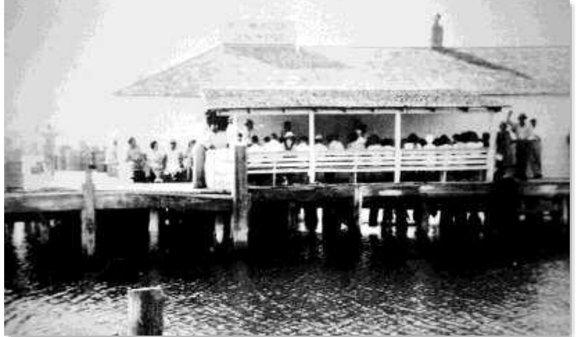
Fall 2018 - Coming Next! Restoration of the 1930's era Will Willis Store & Fish House, OWWA Exhibit upgrades and replacement of dock.

The Community Square sits on the shore of Silver Lake in the heart of Ocraoke village directly across from the lighthouse, built in 1823. Early island photographs depict how life was centered around the iconic Community Store, the Will Willis Store & Fish house, the Ice Plant and the island's first generator plant.