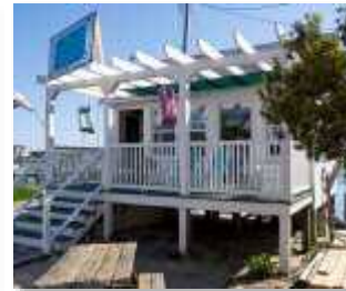
Electric Office, ca. 1936