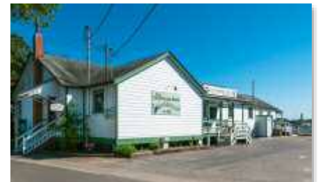
Community Store: Rebuilt in 1950 after storm of '44.

“OFI’s multi-faceted approach to the preservation of special places like the Community Square serves as a sustainable model for other rural communities, where the potential is great but the funding is limited.