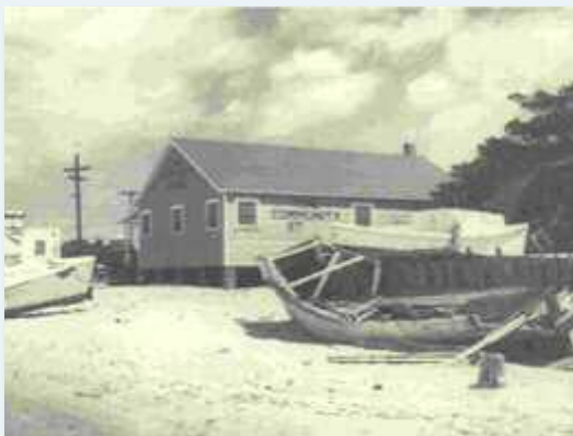
The Community Store entrance from the harbor, before the storage room moved to this end.