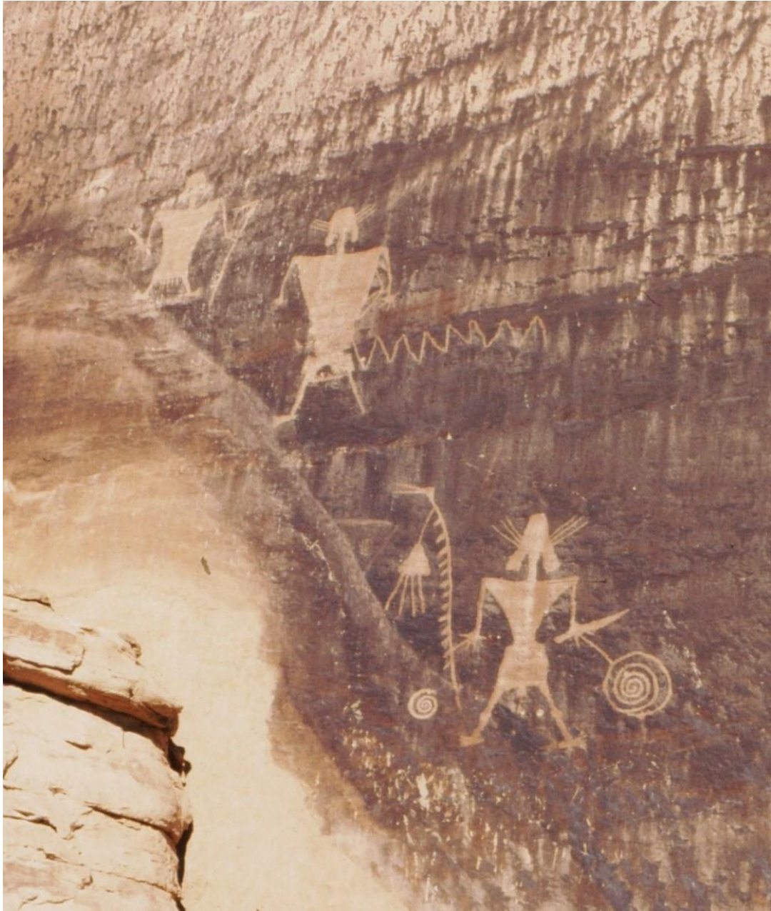
Gore Ranch, Glade Park, Uncompahgre Plateau, Mesa County, CO. Photo: Peter Faris, 1980.

There is a marvelous panel of Fremont figures located on Gore Ranch, in Glade Park on the Uncompahgre plateau of Mesa County, Colorado. The three stylized figures have been pecked very carefully in great detail up the cliff.