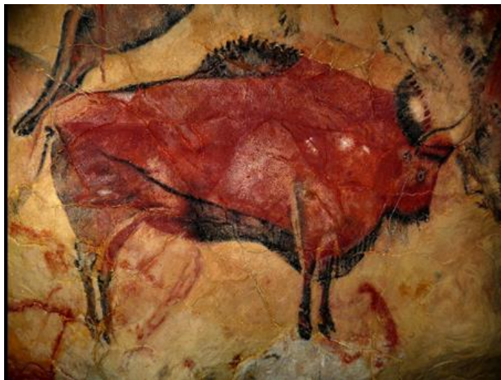
Painting from Altamira Cave