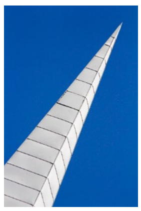
13. Pointed Fred Cerkan

12. Something the color blue Kushal Bose