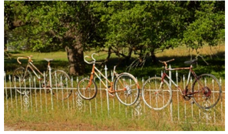
8. A fence Beverly Lyle