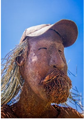
14. Rusted Kushal Bose