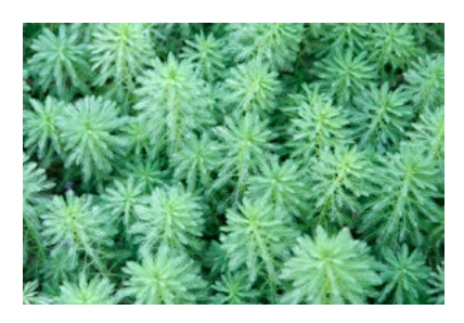
17. Texture Fred Cerkan