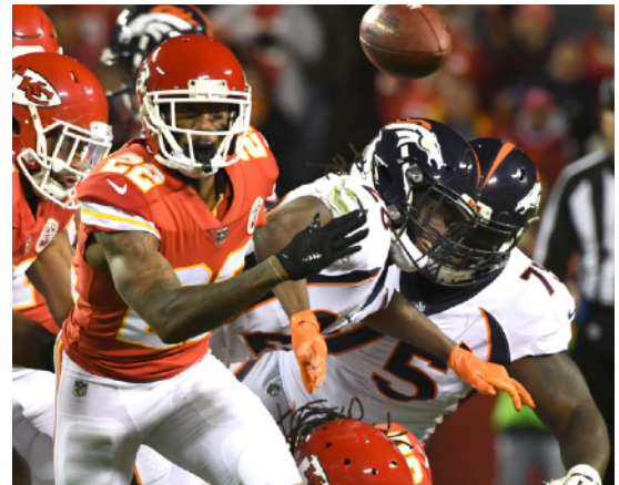
The Broncos suffered a definitive loss against the Kansas City Chiefs on Monday.

The quarterback continued to respond to flabbergasted reporters stating, "I'm honestly surprised this is a shock to anyone. I mean, did you see the Chiefs game? My turnovers were so obviously intentional, I don't know how anyone could have missed it."