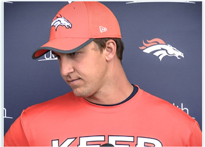
Trevor Siemian at yesterday’s press conference confirming his decision to go on strike for a small Catholic academy.