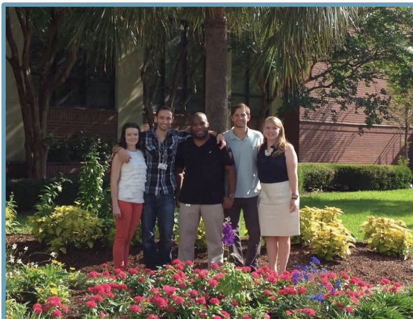
Pictured from left to right are:

These paid internships will run for approximately 10 weeks allowing the students to gain critical laboratory and clinical research experience.