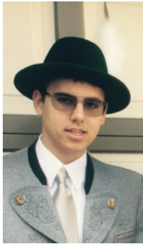
To our own