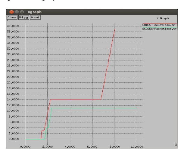
Fig.3 Packet loss Graph

As shown in figure 2, the existing and proposed scenario is compared in terms of energy consumption. In the energy graph it is shown that in the proposed scenario is less due to multiple sink deployment in the network.