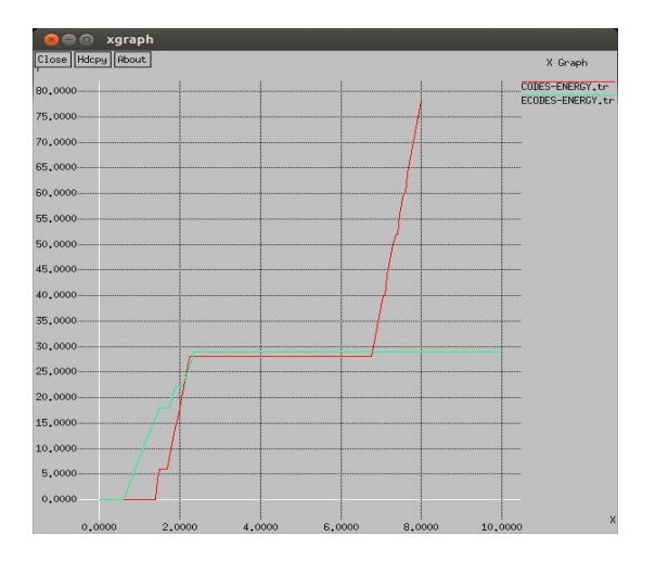
Fig. 2 Energy Comparison

The proposed algorithm is implemented in NS2 and the results are analyzed by making comparisons with the existing approach that uses data window aggregation function with static sink, in terms of various parameters like energy, throughput and packetloss.