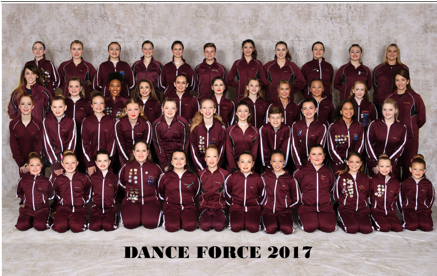
DANCE FORCE 2017