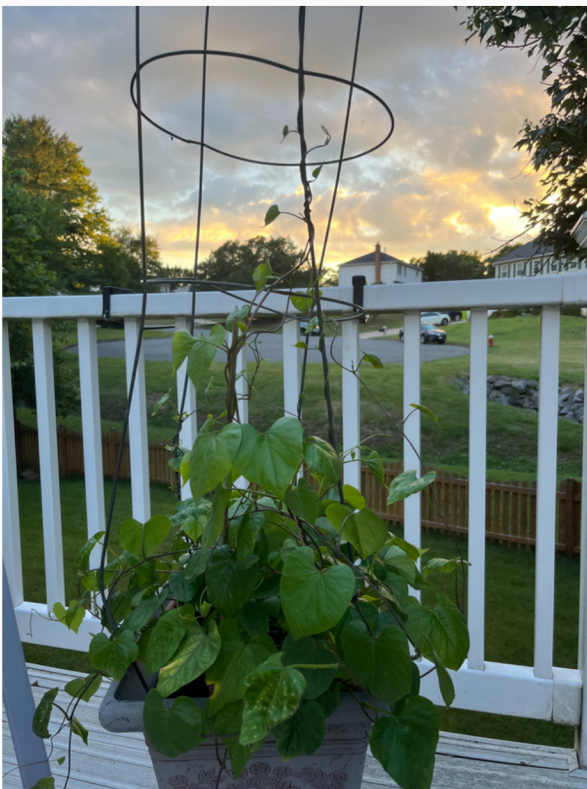
Porch Sunset View

Each month we'll feature photos taken by our residents. Submit your images for the chance to be featured.