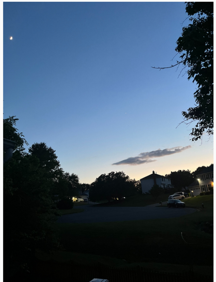
Sunset splendor featuring the Moon

Email submissions by July 24 to pbergeron333@gmail.com