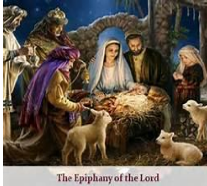
The Epiphany of the Lord

Church: 532-2912 Campus: 477-1244 Fax: 532-3905 Office Hours: Mon. – Thurs. 9:00-4:00