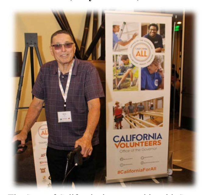
The State of California, in partnership with San Diego Gas and Electric and many CERT (Community Emergency Response Team

California for All CERT and Listos Conference, May 30-June 1, 2019