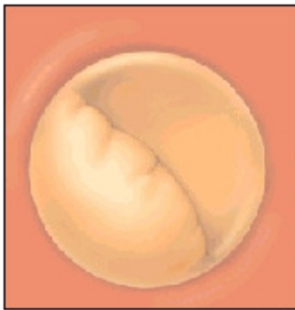
Closed mitral valve with prolapse (viewed from above).