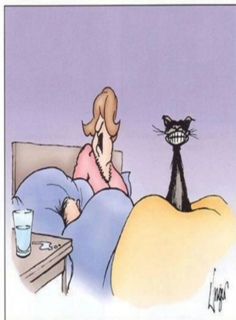
"Wake up. The cat's got your teeth."