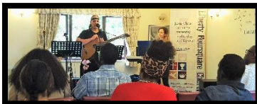
ENGLAND LIBERTY CHURCH

We travelled from Mossel Bay to East London for 5 weeks during May and June 2016. We visited 32 venues including prisons, radio stations - live, businesses, home cells and groups of different denominations, spreading the challenge of going fulltime for JESUS.