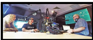
NEW ZEALAND – RADIO RHEMA