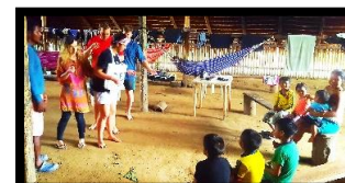
DOING JESUS DRAMA

Here we did a week's tour through Leeds, Coventry and Bedfordshire before leaving for the Amazon. We were invited to several venues including a specially arranged leaders' meeting, having powerful sessions in sharing about the urgent call of JESUS.