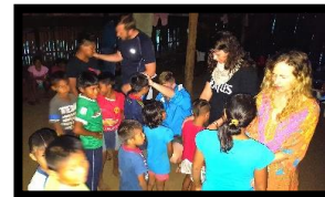
PRAYING FOR HEALING

leave you. As "it takes a village to raise a child," so it takes a team to disciple a person – start getting involved today!