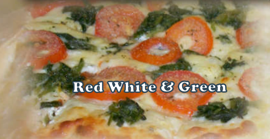
Red White & Green

CHICKEN WING - Shredded chicken, ranch crumbly bleu cheese, mozzarella and wing sauce topped with chopped celery.