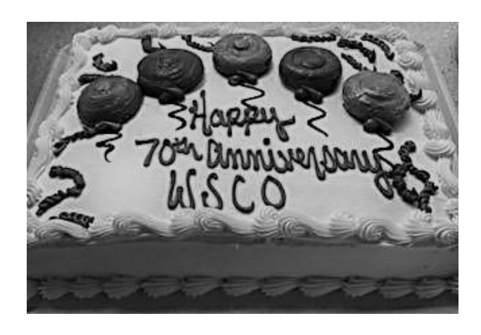
Figure 1 WSCO Cake in Celebration of our 70th anniversary