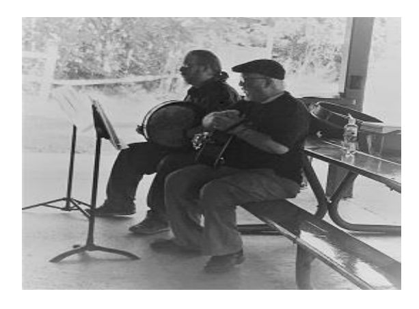
Figure 2 Down the Glen provided our music

Thank you to all who attended, and to all who helped to organize this event.