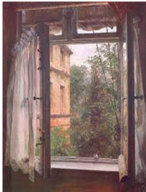
THE OPEN WINDOW BY HH MUNRO A double bill