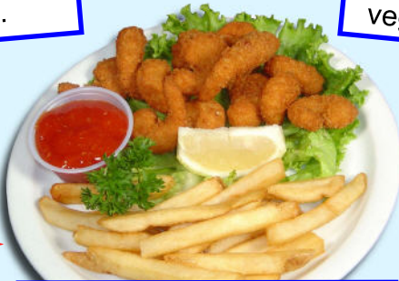
POPCORN SHRIMP Served with steamed vegetables or French fries.