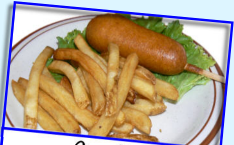
Corn Dog Served with steamed vegetables or French fries.

Order a sundae with lunch or dinner for .99¢