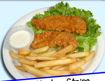
Chicken Strips 2 Strips served with French fries or steamed vegetables.