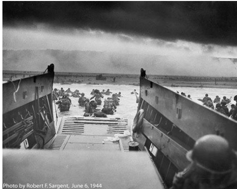
June 6, 1944