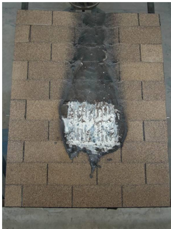
Fig 3 – Burning Brand Top Surface (After Testing)