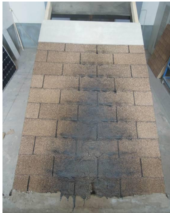
Fig 2 – Intermittent Flame Exposure Top Surface (After Testing)