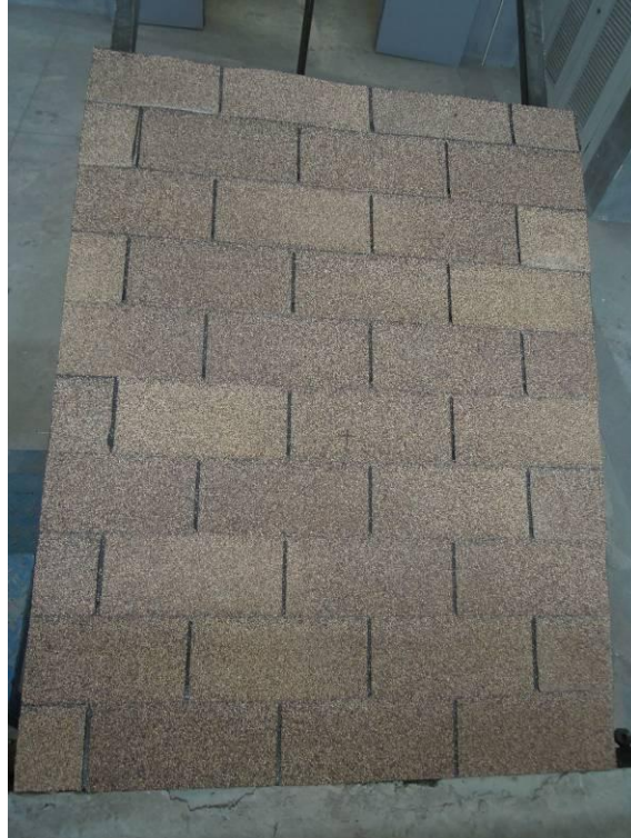
Fig 3 – Burning Brand Top Surface (Before Testing)