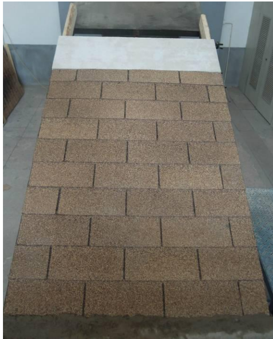
Fig 1 – Intermittent Flame Exposure Top Surface (Before Testing)