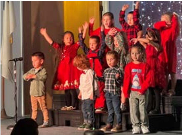
Preschool Christmas play