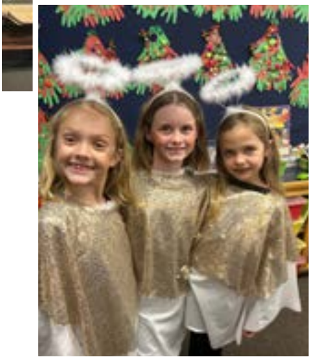
Kindergarten to second grade Christmas play