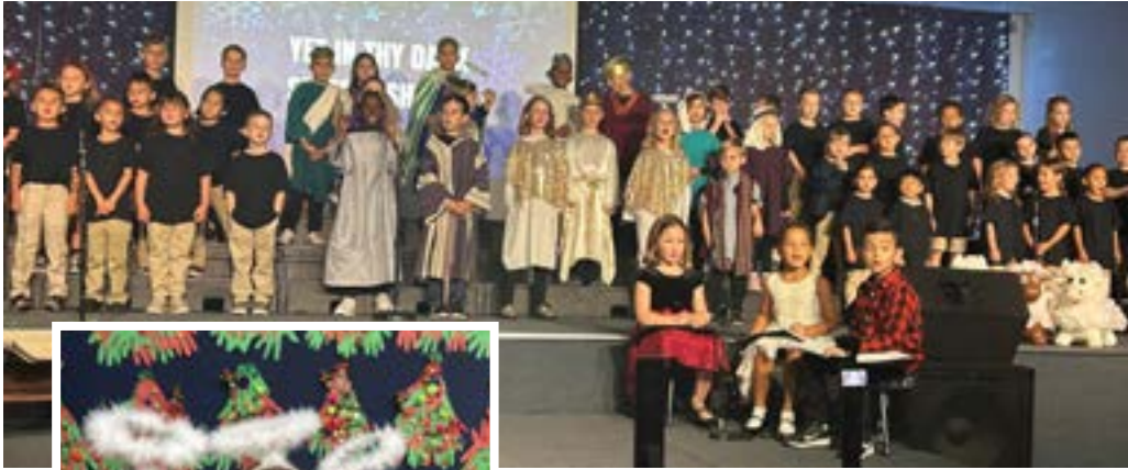
Third to fifth grade Christmas play.

The collaboration between eighth-grade buddies and their first-grade counterparts at TCS fosters a unique bond that transcends grade levels. In this mentoring program, the eighth-grade students take on the role of mentors, assisting their first-grade buddies in their classwork and various projects. Witnessing the older students patiently working with the younger ones enhances academic understanding and creates a nurturing environment where friendships can grow. The eighth-grade buddies serve as