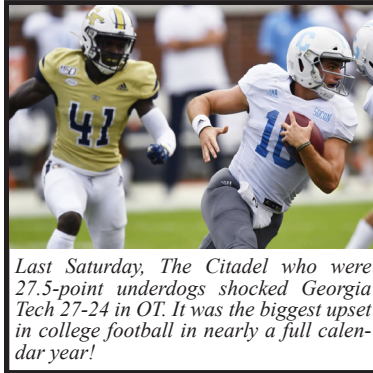
Last Saturday, The Citadel who were 27.5-point underdogs shocked Georgia Tech 27-24 in OT. It was the biggest upset in college football in nearly a full calendar year!